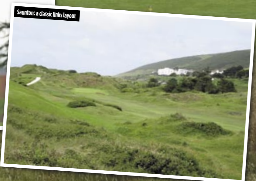
Saunton: a classic links layout